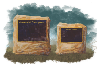
Centennial Monument Concept