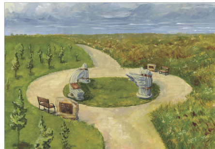
Overall Centennial Grove Concept