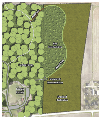
Centennial Grove Project 800-Tree Planting & New 23-Acre Prairie